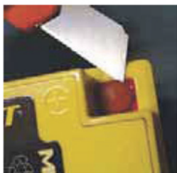
Removal of terminal plugs