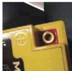
Terminal plug removed showing nutsert