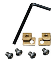
Battery Terminals, Wrench and Fasteners

Examples of what parts may come with your battery: