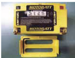
The Motobatt battery out of the box