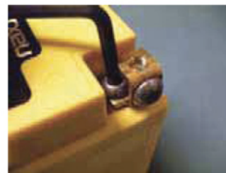
Attaching the terminals

These are the different configurations available with the included terminal adaptors: